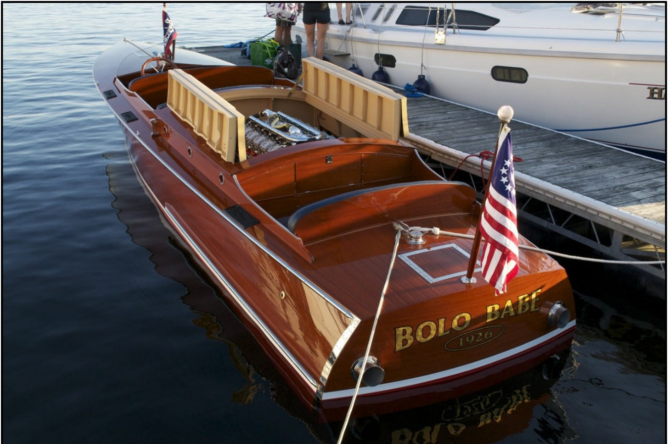
Coming to an ACBS Boat Show near you